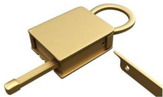
(a) Step 1