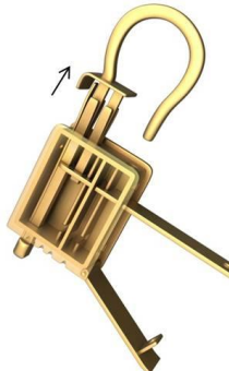
(f) Step 6