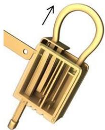
(b) Step 2