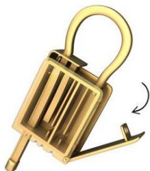
(c) Step 3