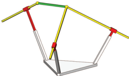
(c) \alpha = 0^\circ